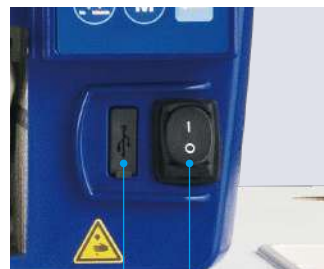
USB port — power switch

The operation panel is equipped with ease with many different functions.